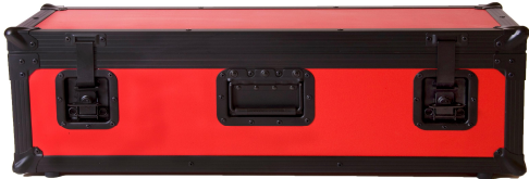
Custom Flight & Transit Cases

Also at - Freight House, Kirkhill Place, Dyce, Aberdeen, AB21 0GU Tel: 01224 729772 Fax: 01224 729773 Email: dyce@trojancrates.co.uk