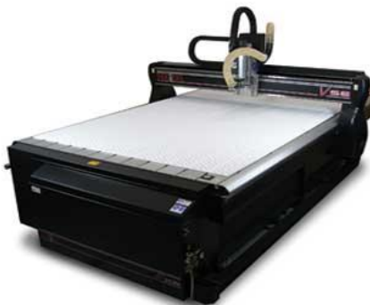
CNC Custom Foam Inserts

Our cases are used by a wide variety of industries, from the Oil & Gas / Subsea industry to National Football Associations travelling to tournaments, we also supply the music industry and emergency services with simpler requests like moving house and re-locations, our cases protect your valuable items time after time.